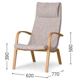
① Japanese Oak NF Linova OR/F3