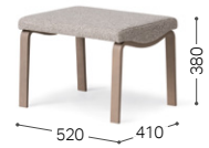
③ Japanese Oak GY Blend LGY/F2