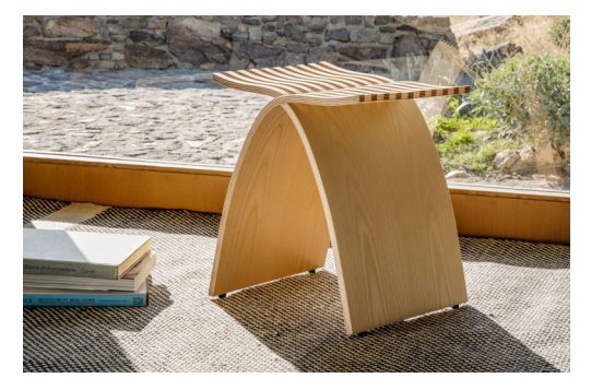
View image library