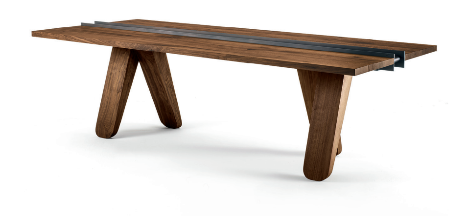
Table made in solid wood, its top in glued lists and straight sides, with a central iron compartment to store objects. The top is supported by four legs with a geometrical section.