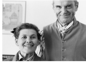
Designers: Charles and Ray Eames