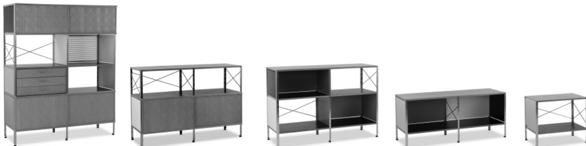
1 unit high/1 unit wide