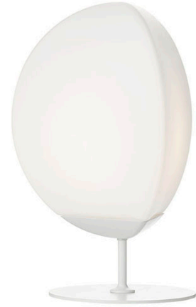
Table lamp with diffuser in satin-finish white blown glass and white painted Plexiglass® structure.