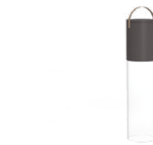
BIG LAMP / CODE: KUKL01