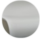
matt white polyethylene