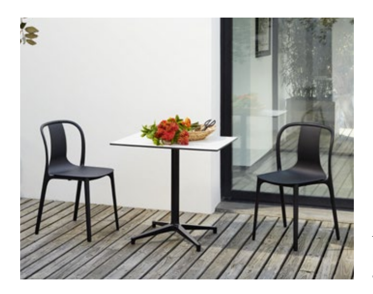
Table tops available in three materials: melamine faced, white surface, smooth straight plastic edge (19 mm); light or dark oak veneer (Europe) (19 mm); solid core laminate in the colours white or black with black edge (12 mm). The solid core table top in black has an additional anti-fingerprint coating.

The version of the Bistro Table – in both heights – with a solid core laminate top and powder-coated base in basic dark is weather resistant and suitable for use on terraces, balconies and in gardens.