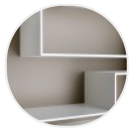
Matt lacquered turtledove