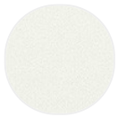
Matt lacquered white X042