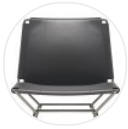
Dark grey R903 Col. 03