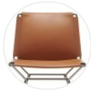
Natural R904 Col. 26