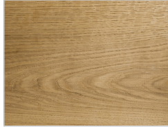
oak without knots finish: neutro