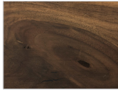
walnut with knots