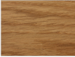
oak without knots