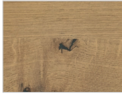
oak with knots finish: neutro