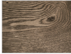
oak with knots finish: mystic black