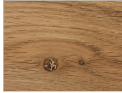
oak with knots