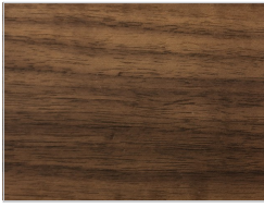
walnut without knots