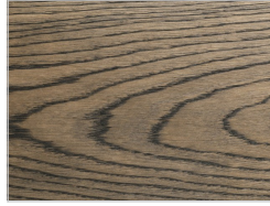
oak without knots finish: mystic black