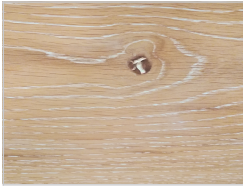
oak with knots finish: whitened