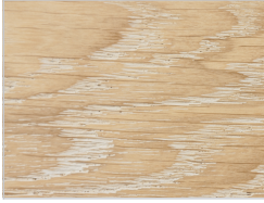
oak without knots finish: whitened