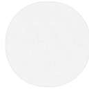
Gloss painted white X060