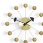
Ball Clock, cherry, Ø 330