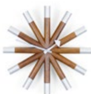
Wheel Clock, walnut/aluminium, Ø 455