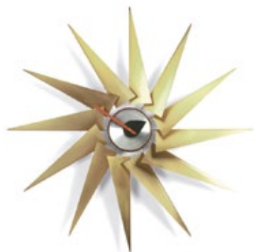
Turbine Clock, brass/aluminium, Ø 765