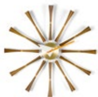
Spindle Clock, aluminium, solid walnut, Ø 577