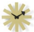
Asterisk Clock, Messing, Ø 250