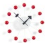
Ball Clock, red, Ø 330