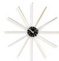
Star Clock, chrome/brass, Ø 610