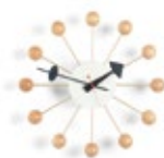
Ball Clock, beech, Ø 330