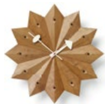
Fan Clock, Kirschbaum (USA), Ø 384