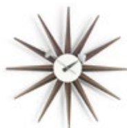
Sunburst Clock, walnut, Ø 470