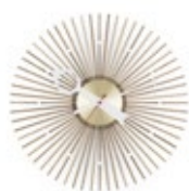
Popsicle Clock, Nussbaum, Ø 350