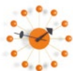
Ball Clock, orange, Ø 330