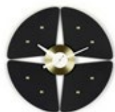
Petal Clock, black/brass, Ø 448