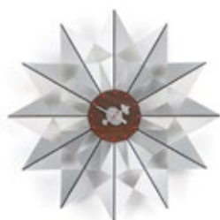
Flock of Butterflies, aluminium, Ø 610