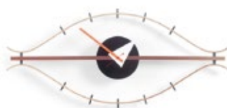
Eye Clock, brass/walnut, H 340 x W 760