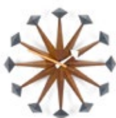
Polygon Clock, walnut, Ø 430