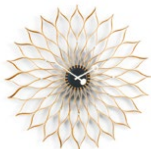
Sunflower Clock, birch, Ø 750