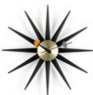
Sunburst Clock, black/brass, Ø 470