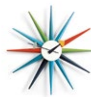
Sunburst Clock, multicoloured, Ø 470