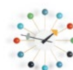
Ball Clock, multicoloured, Ø 330