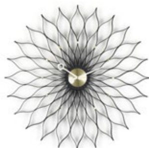
Sunflower Clock, black ash/brass, Ø 750