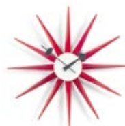
Sunburst Clock, red, Ø 470