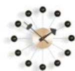
Ball Clock, black/brass, Ø 330