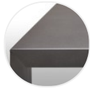
Goffered matt painted pewter X129