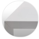
Goffered matt painted white X124