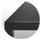
Goffered matt painted black iron X130