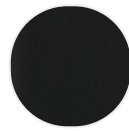
Reconstructed stone black slate X132