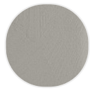
Reconstructed stone white Calce X131