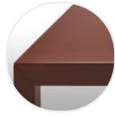
Goffered matt painted corten X128