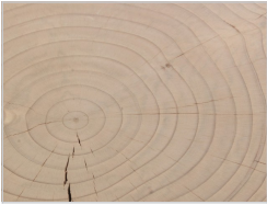
cedarwood contract finish