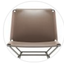
Turtledove R906 Col. 29